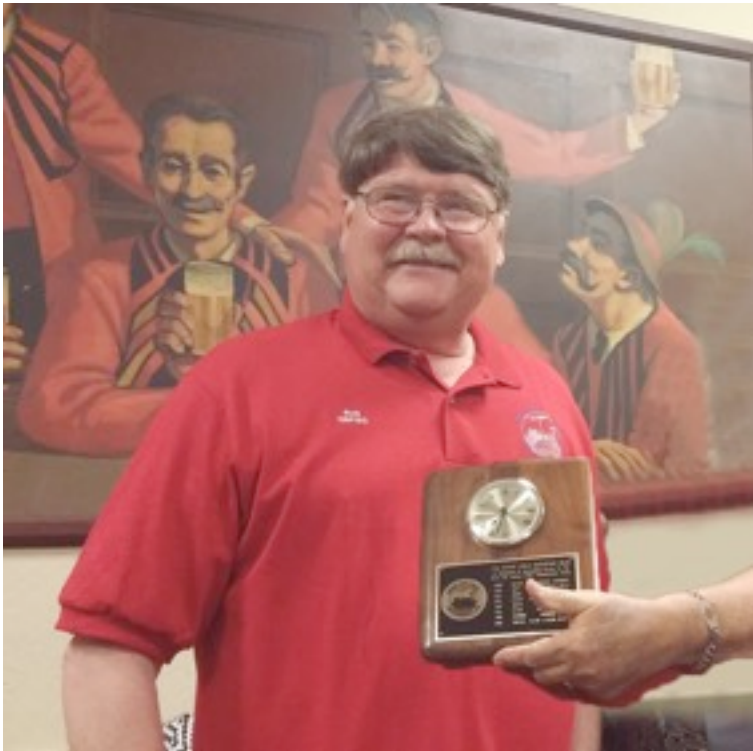
Bob Woodward is awarded the Lyle AuFrank award.