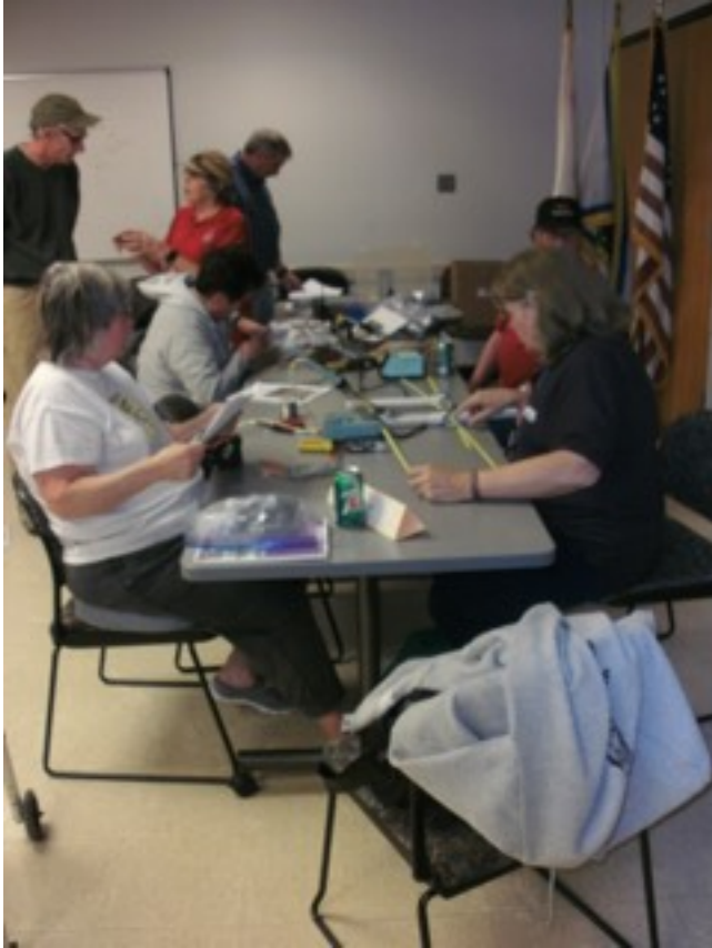
A photo from last years Elmer night.