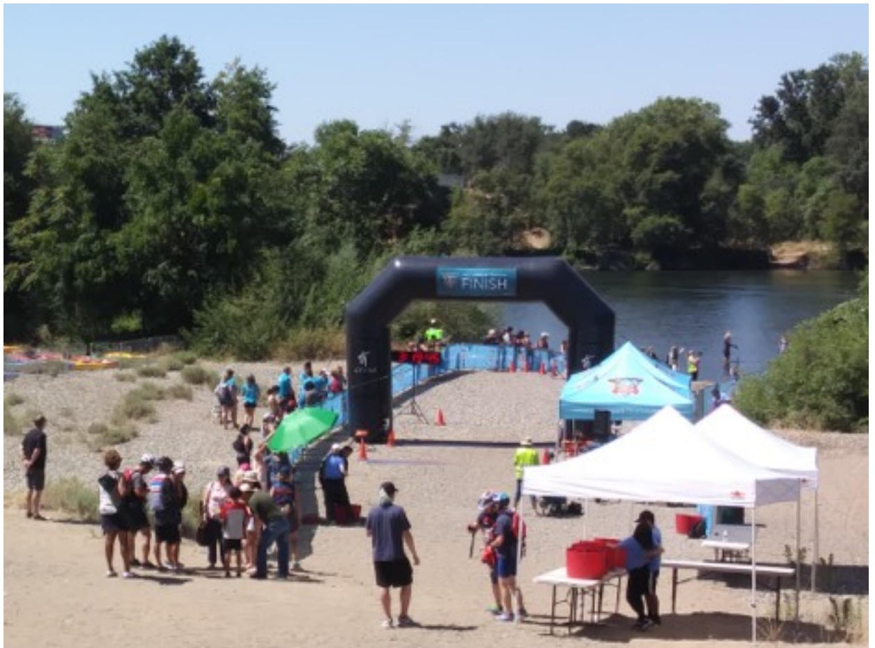
Triathlon Finish line.

The club has an Elmer program where new hams can get help from older hams. If you need help with something contact a board member. If you would like to help others let a board member know and what your area of expertise is. It doesn't have to be complex electronics, it could as simple as labor to help put up a mast. By volunteering you will help others and maybe make a new friend.