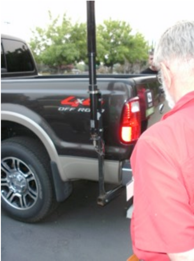
HF antenna mounted on N6PGQ's truck. Part of our mobile mount show.