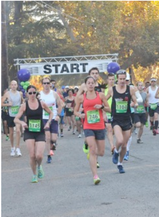
Runners in the Clarksburg race. See page three.