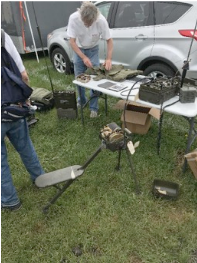
National Hamvention