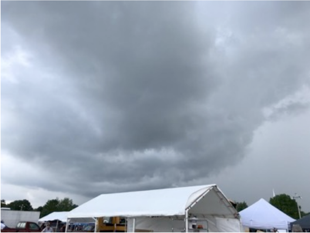
Everybody head for cover.