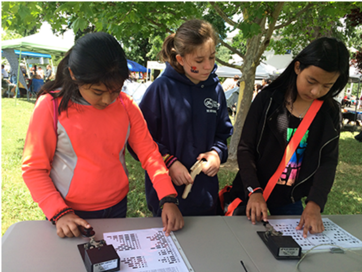
Three girls sending their name in morse code