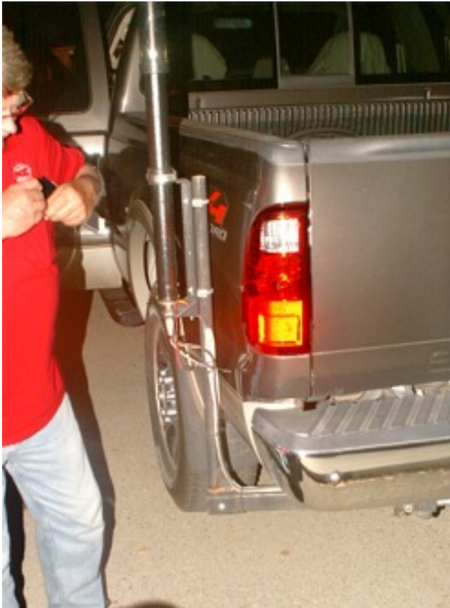
A screwdriver antenna mounted on a bracket.