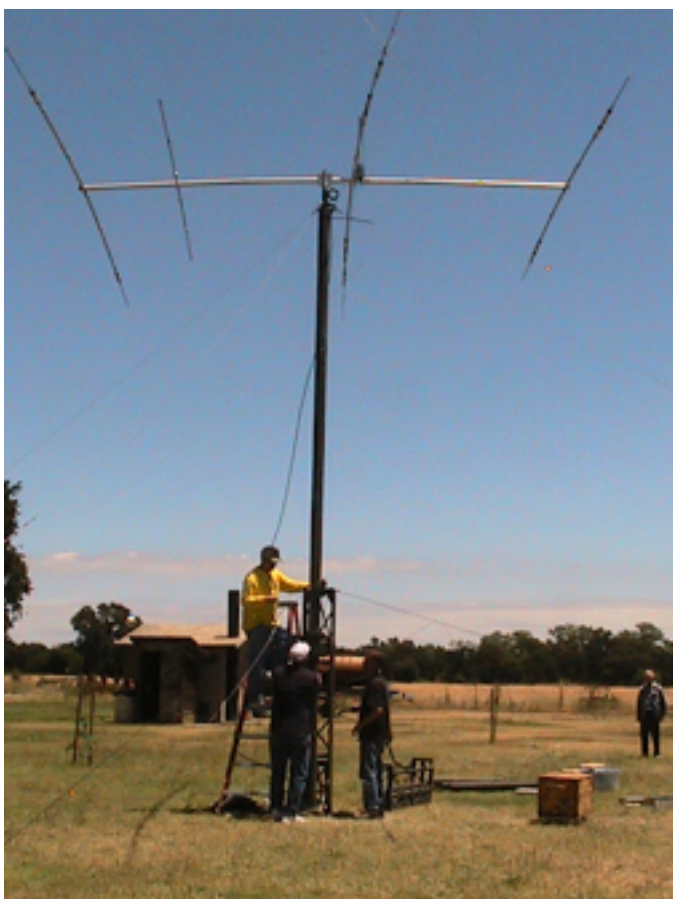
Erecting an antenna at field day.

Due to the Primary Election the June meeting has been changed to Wednesday the fourth.