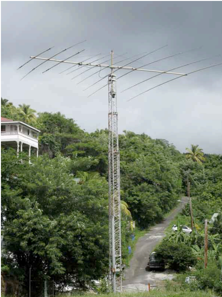
Antenna of the radio club on the island of Dominica

With the start of the new year dues for 2011 are due.