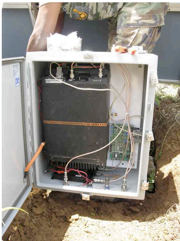
Repeater in new housing.